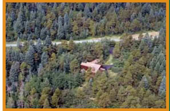
Figure 28: This house has a high risk of burning during an approaching wildfire. Modifying the fuels around a home is critical to reduce the risk of losing structures during a wildfire.