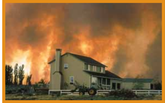
Figure 1: Firefighters will do their best to protect homes, but ultimately it is the homeowner's responsibility to plan ahead and take actions to reduce fire hazards around structures.

In this guide, you'll read about steps you can take to protect your property from wildfire. These steps focus on beginning work closest to your house and moving outward. Also, remember that keeping your home safe is not a one-time effort – it requires ongoing maintenance. It may be necessary to perform some actions, such as removing pine needles from gutters and mowing grasses and weeds several times a year, while other actions may only need to be addressed once a year. While