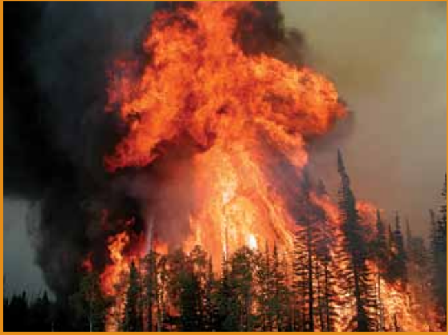
Figure 3: Burning embers can be carried long distances by wind. Embers ignite structures when they land in gaps, crevices and other combustible places around the home.

Heavier fuels, such as brush and trees, produce a more intense fire than light fuels, such as grass. However, grass-fueled fires travel much faster than heavy-fueled fires. Some heavier surface fuels, such as logs and wood chips, are potentially hazardous heavy fuels and also should be addressed.