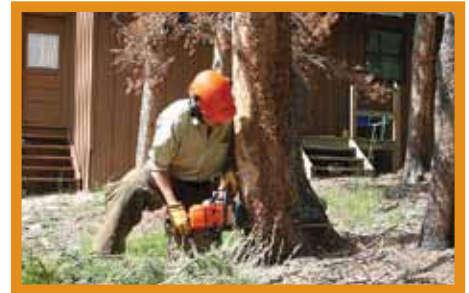
Figure 26: Keeping the forest properly thinned and pruned in a defensible space will reduce the chances of a home burning during a wildfire.