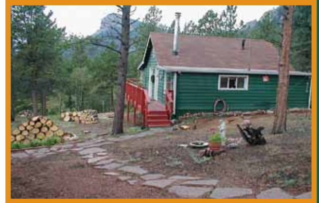
Figure 12: Homesite after creating a defensible space.