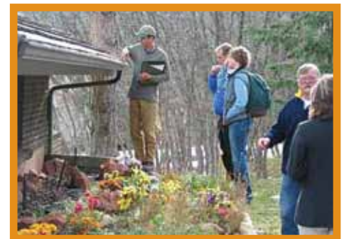
Figure 27: Sharing information and working with your neighbors and community will give your home and surrounding areas a better chance of surviving a wildfire.